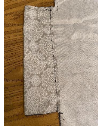
Photo of finished product front and back Diameter of the PVC you are using: 1 inch